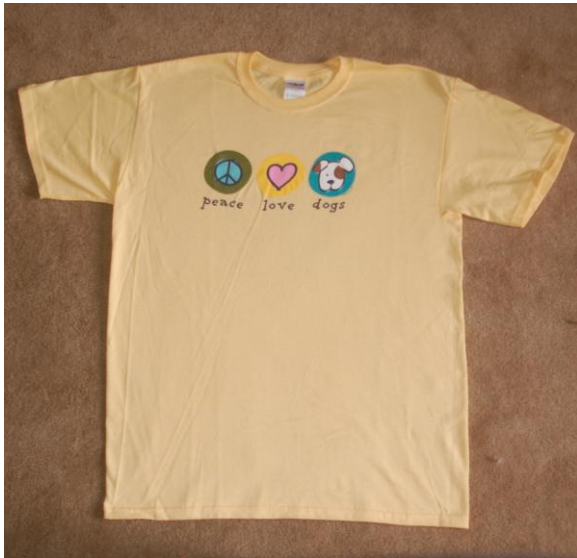
Illustration reads: peace love dogs

BGRC is selling these t-shirts to help pay for the new mats we need for our March 2010 Specialty.