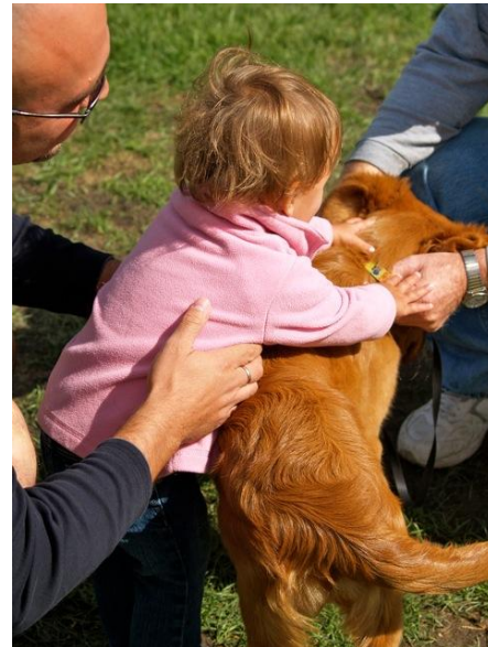
More photos on page 5.

BGRC was again well represented at the Labor Day weekend Highland Games. This is a great event where members have a chance to show off their beloved Golden Retrievers, interact with the public (kids can't resist our beautiful pals), and answer questions about the breed.